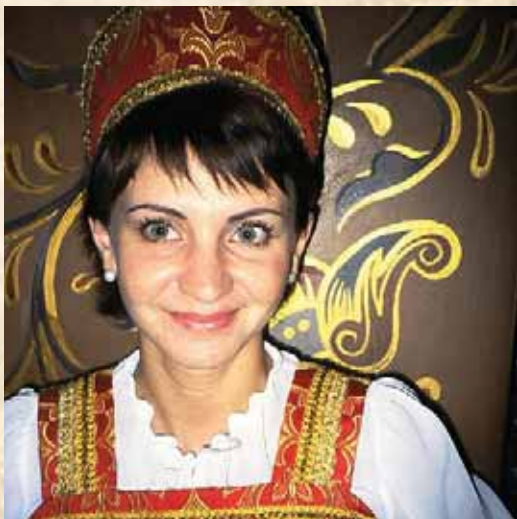
Ukrainian folk costume

Traverse a little-known region that has changed hands from its earliest history. Belarus, Ukraine and Moldova are three of the least-frequented and least familiar countries in Europe. Time slowed drastically here after the devastation of World War II, but these beautiful countries are emerging from the shadows.