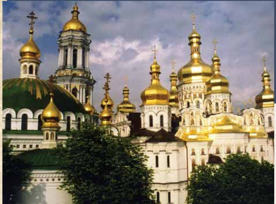
Kiev's Caves Monastery, Pecherskaya Lavra

Traverse a little-known region that has changed hands from its earliest history. Belarus, Ukraine and Moldova are three of the least-frequented and least familiar countries in Europe. Time slowed drastically here after the devastation of World War II, but these beautiful countries are emerging from the shadows.